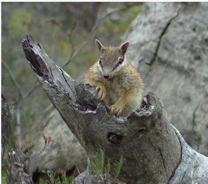
Numbat at Boyagin (Tamara Wilkes-Jones)

Here are two examples of numbat pictures you can find in our gallery. We will constantly be updating our Gallery with new numbat pictures.